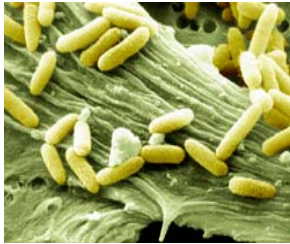
E. coli is only one bacteria found in pet waste.

Children who play outside are at the highest risk of infection from bacteria and parasites found in pet waste. Flies may also spread diseases found in pet waste. Diseases that can be transmitted from pet waste to humans include: